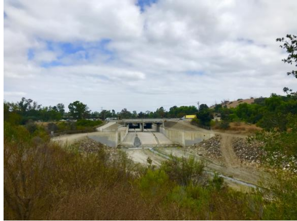
Site 2: Santa Margarita River Bridge Replacement Project at Sandia Creek (Fallbrook)